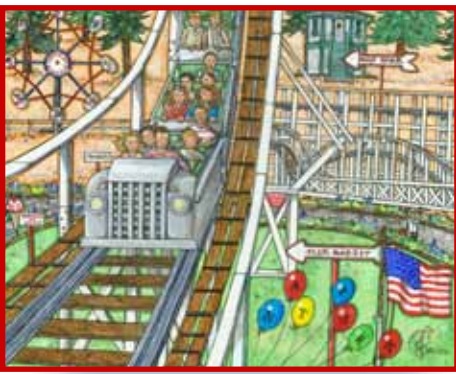
THE NORTH SIDE • GRAND OLD NATATORIUM PARK

25 FINE ART "AMERICANA" PAINTINGS OF INLAND NORTHWEST PARKS AND GARDENS • INCLUDING THE MANITO PARK COLLECTION, MOORE-TURNER HERITAGE GARDENS, OTHER SPOKANE COUNTY PARKS, RIVERSIDE AND MOUNT SPOKANE STATE PARKS