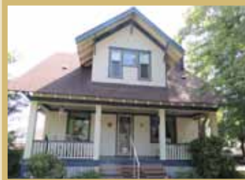
The 1906 Hunter-Brodrecht House