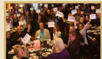
(Above) The German-American Society building and folks at the SPA auction fundraiser