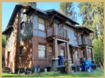
The 1910 Mary Frances Apartments