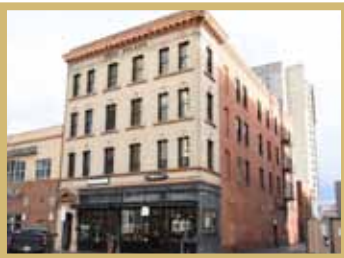
The 1909 Dodson Building