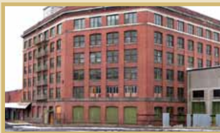
(Left to right) Historic Chancery Building and the Jensen-Byrd Warehouse