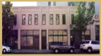
The 1893 Webster Building