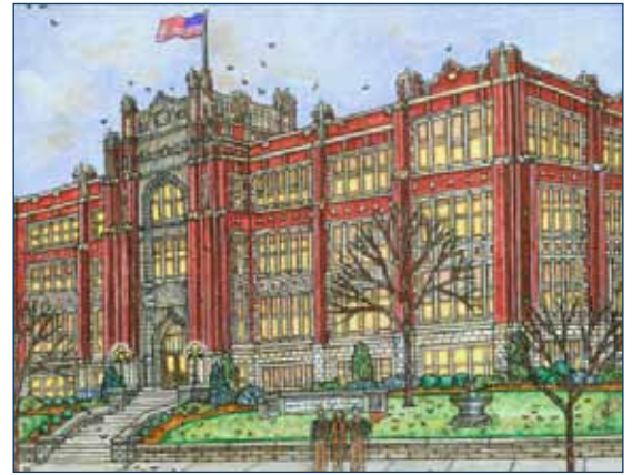
Lewis & Clark High School (1912) just listed on the Spokane Register of Historic Places (Art used by permission of Patti Simpson Ward)

~ The Historic Preservation Office, like most other City Departments, has continued to maintain a flexible telecommuting and sometimes office presence since the middle of March 2020 in response to the COVID-19 crisis. The Spokane Historic Landmarks Commission is still reviewing changes to historic buildings, listing properties on the Spokane Register of Historic Places and administering Special Tax Valuation incentives to eligible properties.