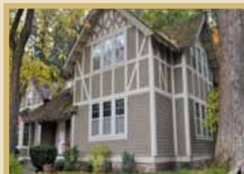
The 1885 Waikiki Farm Manager's Residence