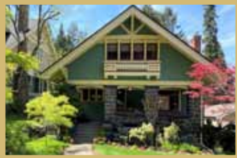
The 1910 Eastman-Heritage House