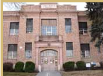
The 1928 Libby Junior High School