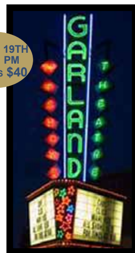
Iconic Sign at the Mid-Century Garland Theater