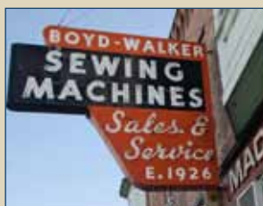
(Lower Right) "Boyd-Walker Sewing Machine Company" from the Megan Perkins' Art Collection picturing the vintage sign on a handsome old brick structure.