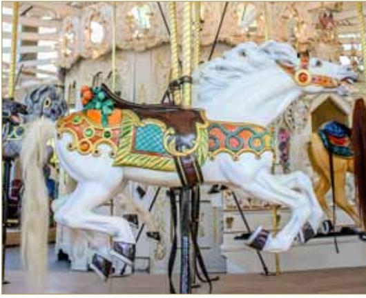
One of the signature white horses on the historic Loeffl Carrousel

our state's clean buildings law which eases compliance for historic buildings.