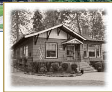
Early spring view of the home with its handsome brick walkway to the front steps and porch.