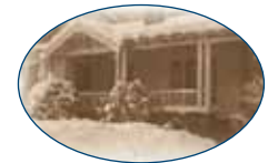
DEC. Lighting up the Lincoln (Street) House CANNON HILL, SOUTH HILL, SPOKANE, WA • PAINTED NOV. 2014