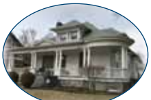
SEPT. Peddling Posies on Park Place • Corbin Park NEW! NORTH SIDE, SPOKANE, WA • PAINTED JUNE 2018