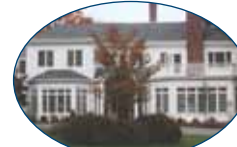
NOV. Flowerfield in the Fall • Davenport "Cottage" SAINT GEORGE'S, NORTH SIDE, SPOKANE, WA • PAINTED JUNE 2008

Of the six milk bottle building planned for the Benawah Creamery, only two were constructed in the mid-1930s. It was still the Great Depression, so Whitehouse & Price's fee of $3,700 for each was pretty hefty. This one and the other on Third Avenue were perfect examples of "literalist" architecture as they pictured what they sold. A favorite North Side café when Patti painted this, she added students from neighborhood high schools - Rogers, Gonzaga Prep, North Central, Holy Names and Shadle.