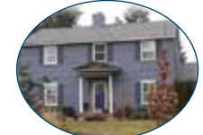
AUGUST Spokane Blandings' Dream House HIGH DRIVE, SOUTH HILL, SPOKANE, WA • PAINTED MARCH 2016