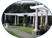
JUNE Romantic Rose Hill • Pergola at Manito Park NEW! MANITO, SOUTH HILL, SPOKANE WA • PAINTED APRIL 2018

This charming ice cream parlor was built in 1939 as Spokane was climbing out of the Great Depression. It was a major stop for folks riding the trolley west on Boone to Natatorium Park (sadly demolished in 1968). Since the 1970s, the little shop struggled to stay open, but its solid reputation for made-from-scratch treats and the development of baby-boomer-filled Kendall Yards, breathed new life into this beloved small neighborhood business (open in warm months only).