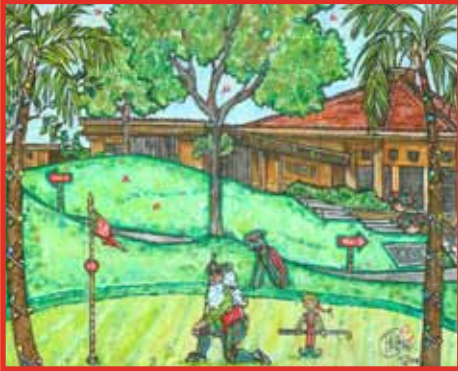
ARIZONA'S ALTA MESA GOLF CLUB

WASHINGTON, OREGON & ARIZONA DESTINATIONS IN THE UNITED STATES AND BRITISH OPEN COURSES & GOLF SHOPS IN THE UNITED KINGDOM