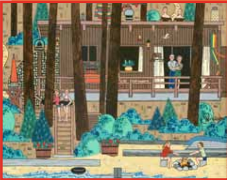
Summertime at Sunset Beach ~ 6.1986

I pictured three generations of the Dix family who have owned this property for decades at Hayden Lake on beautiful Sunset Beach. This is how Kathleen Dix described a magical day there. "It often starts in the morning before breakfast when many of us go water skiing. Then the fun of building sand castles begins - digging, making decorations in the sand and pushing toy boats around in the water. Nothing's better than a cold drink and a good read on a comfy chair under the umbrella. It's great fishing right off the dock. Even a turtle or two can be caught nearby and released to see which one makes it back into the lake first. As the sun dips below the skyline seen from our wonderful beach, the fire is built for roasting hot dogs - and of course, s'mores. The orange, red and golden hues make us smile as one more day at Sunset Beach comes to a end."