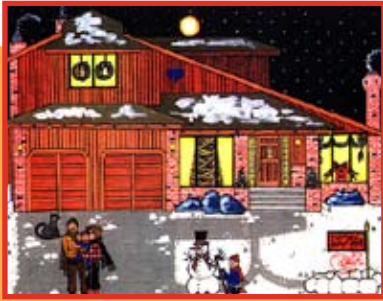
The Barton Snow Fort (1992)

FAMILY HOMES AND MORE IN THIS PRETTY RESIDENTIAL NEIGHBORHOOD EAST OF SPOKANE