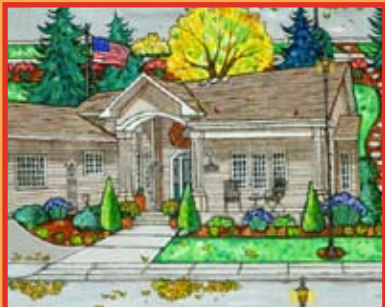
Fine Fall Finish (Detail - Garrett House)