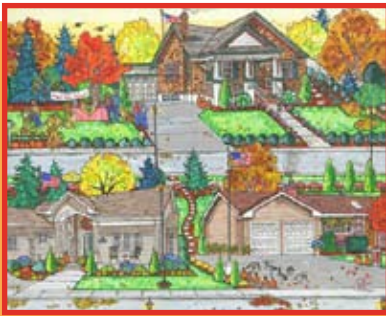
Fine Fall Finish

FAMILY HOMES AND MORE IN THIS PRETTY RESIDENTIAL NEIGHBORHOOD EAST OF SPOKANE