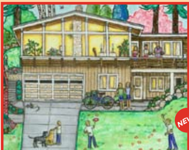
Springtime Comes to Simpson Street (Detail)