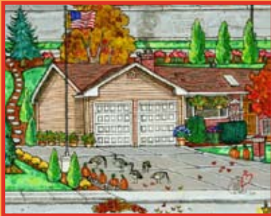
Fine Fall Finish (Detail - Elliott House)