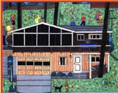
Playing Badminton on Bowdish