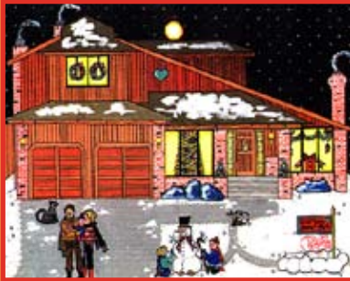
The Barton Snow Fort (1993)