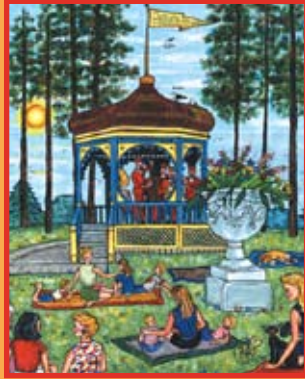
Pavilion at Coeur d'Alene Park