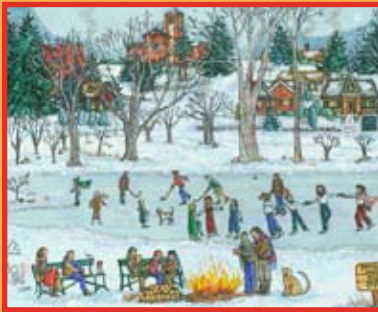
Cavorting at Cannon Hill Pond