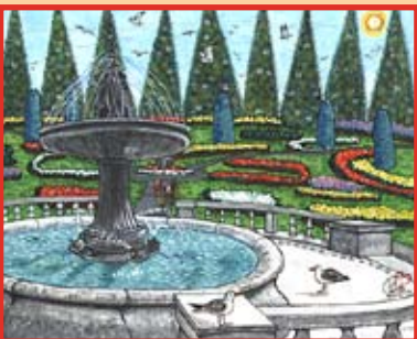
Davenport Fountain at Duncan Garden (Summer)