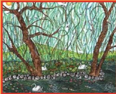
The Swans at Manito Pond (Spring)