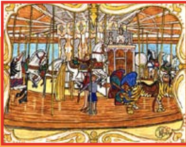
The Golden Carousel

DOWNTOWN, BROWNE'S ADDITION, THE SOUTH HILL, NORTH SIDE & MOUNT SPOKANE