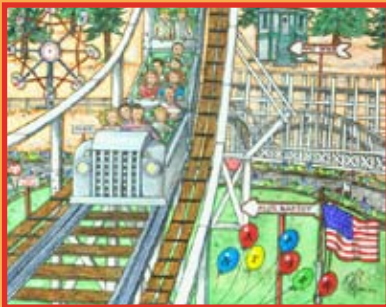
Riding the "Jack Rabbit" at Nat