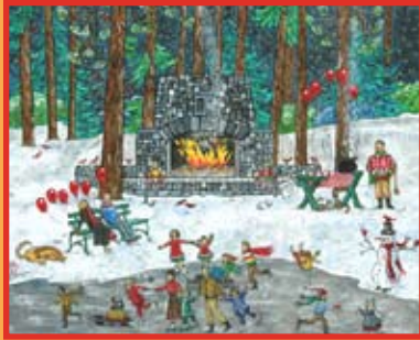
Fun & Frolic at the Manito Fireplace

DOWNTOWN, BROWNE'S ADDITION, THE SOUTH HILL, NORTH SIDE & MOUNT SPOKANE