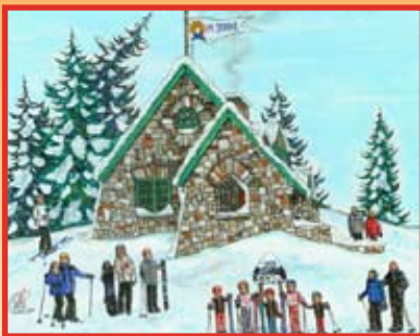
Vista House View