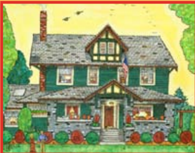
The Handsome Hansen House