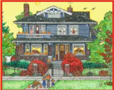
Fine Fall Foursquare (Iverson House)