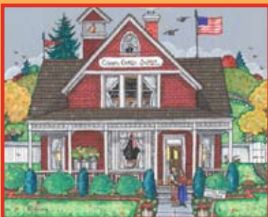
Crimson Castle School