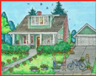
Fresh Flowers at the Wershing House