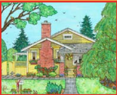
Brick Bungalow Beauty