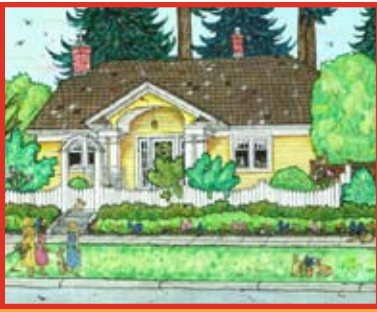
Hippity Hoppin' at the Hill House

WESTERN WASHINGTON'S PICTURESQUE COMMUNITY OF REMARKABLE HISTORIC HOMES, BED & BREAKFASTS, GIFT SHOPS AND ANTIQUE EMPORIUMS