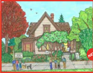
Blackman House Beauty

WESTERN WASHINGTON'S PICTURESQUE COMMUNITY OF REMARKABLE HISTORIC HOMES, BED & BREAKFASTS, GIFT SHOPS AND ANTIQUE EMPORIUMS