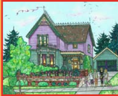
Pretty Purple Palace (Allen House)