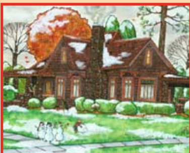
Making Snowmen at the Marks House