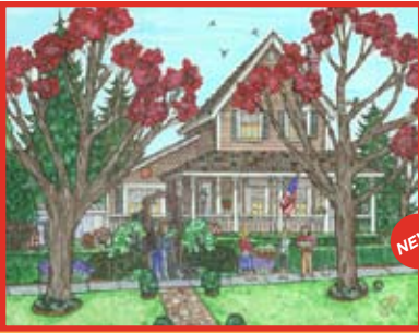
Cozy Cottage on the Corner

WESTERN WASHINGTON'S PICTURESQUE COMMUNITY OF REMARKABLE HISTORIC HOMES, BED & BREAKFASTS, GIFT SHOPS AND ANTIQUE EMPORIUMS