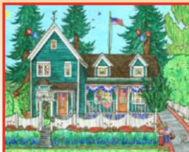
Stars & Stripes in Snohomish