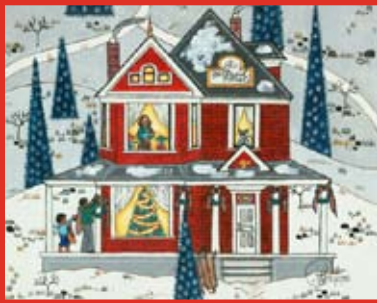
Holidays with the Holland Family (Harmon House)