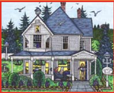
Blue Birdhouse B&B