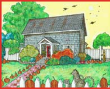
Pussycats & Pumpkins (Jordan House)