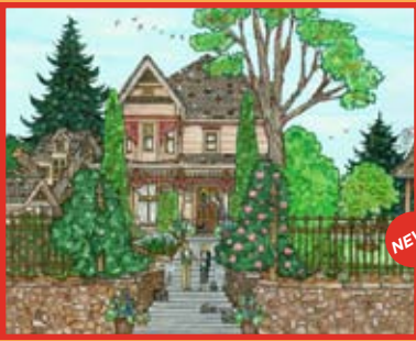
Treehouse Treasure at Tea Time (Vestal House)