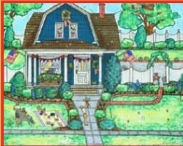
Independence Inn (Matt Albert House)