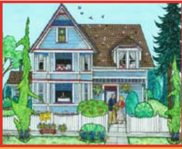
Pretty Parsonage in May

WESTERN WASHINGTON'S PICTURESQUE COMMUNITY OF REMARKABLE HISTORIC HOMES, BED & BREAKFASTS, GIFT SHOPS AND ANTIQUE EMPORIUMS