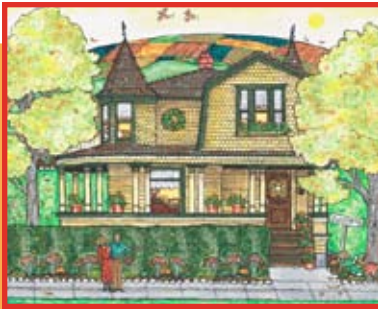
Sunflowers in Snohomish (Blackman House)

WESTERN WASHINGTON'S PICTURESQUE COMMUNITY OF REMARKABLE HISTORIC HOMES, BED & BREAKFASTS, GIFT SHOPS AND ANTIQUE EMPORIUMS