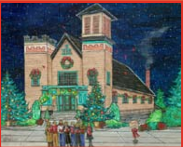
Merrymaking at Saint Michael's