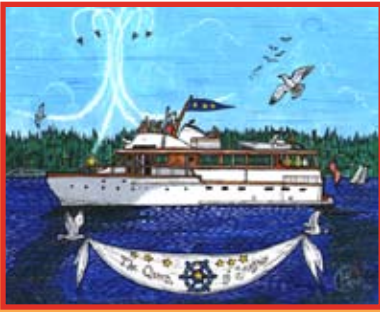
The Queen of Seafair

BALLARD, CAPITOL HILL, GREEN LAKE, LAKE WASHINGTON, LESCHI, MAGNOLIA, PIONEER SQUARE, PORTAGE BAY, VIEW RIDGE AND WALLINGFORD