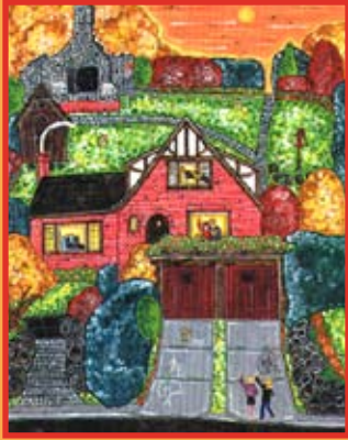
The Husky House