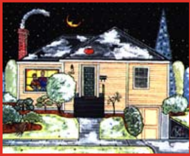
Leslie's Little House