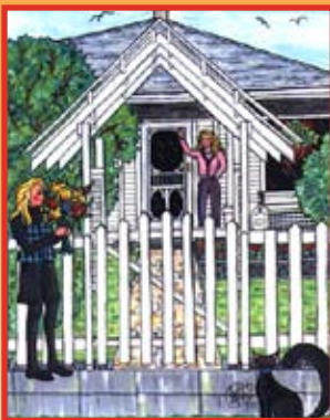
Visiting Claudia's Cottage