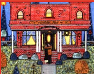
Winter at the Wallingford Arms