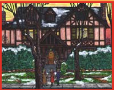
The Stimson-Green Mansion on Capitol Hill