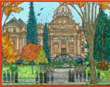
Autumn at The Academy Through the Years