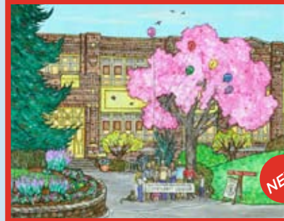
JUNE "Spring at the Old Redmond School"