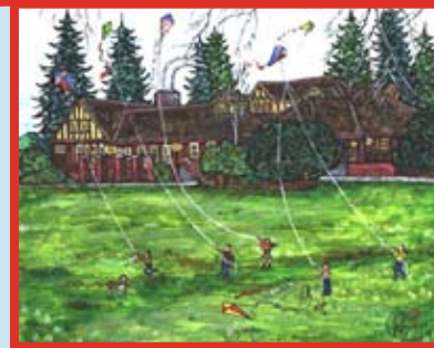
MARCH "Flying Kites at the Clise Mansion"