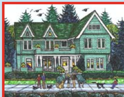
OCTOBER "Walking Dogs at the Judge White House"