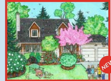
APRIL "American Roots in Redmond"