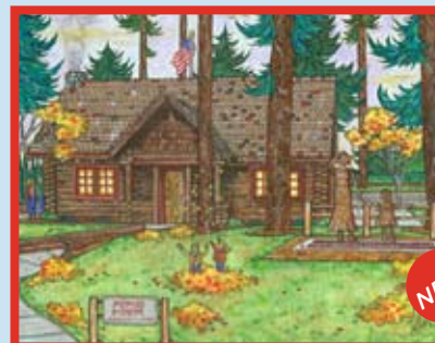
NOVEMBER "Antics at Anderson Park (Adair House)"