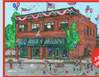
JULY "The Bill Brown Building"