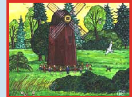
AUGUST "Ring Around the Marymoor Windmill"