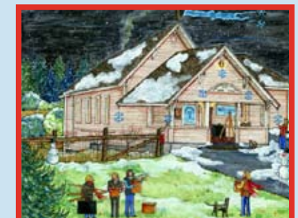
DECEMBER "Gathering at the Grange (Happy Valley)"