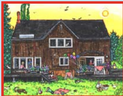
SEPTEMBER "Kleeman's Country Picnic"