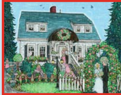
FEBRUARY "Rapture at Rosetree Cottage"