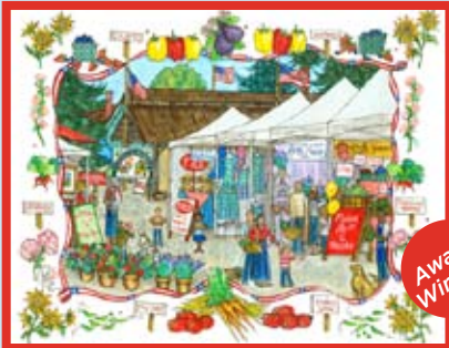
MAY "Meeting at The Market"