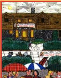
Rain or Shine at "The Canyon"