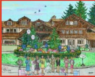
Celebrating at Seattle Golf Club