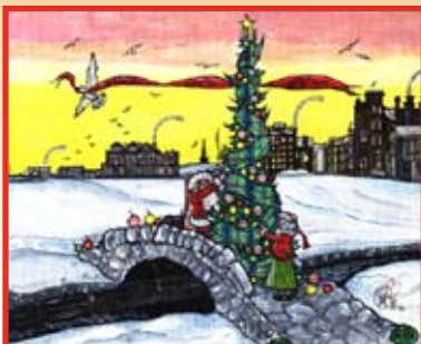
Decorating the Bridge on 18 - St. Andrews