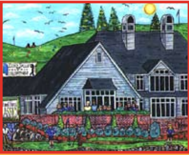
The Classic at Echo Falls

ASSORTED PACIFIC NORTHWEST & SCOTLAND SETTINGS