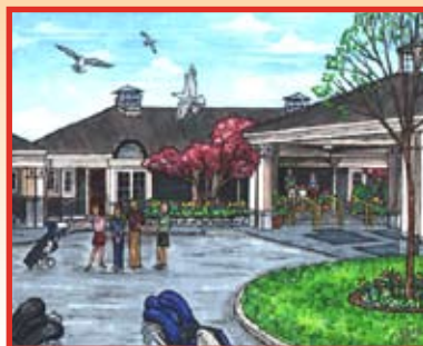
Overlake Golf & Country Club