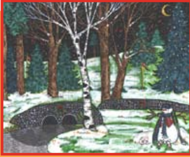
The Snowy Sentinel at R.O.C.C.