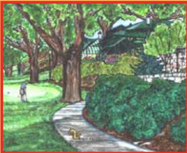
Perfect Labor Day Morning at R.V.C.C.