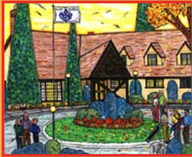
Autumn Golfing at "The Glen"