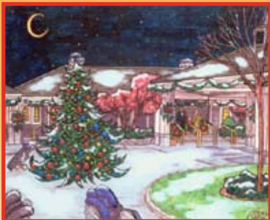
Celebrating the Season at Overlake Golf & C.C.