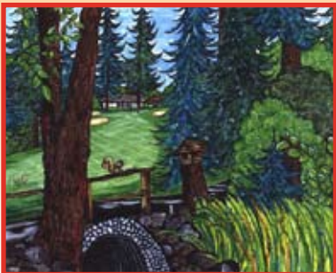
Aviary on Eight - R.O.C.C.