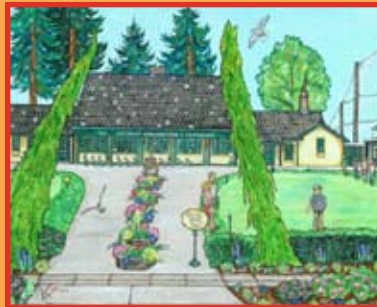
Cottage Clubhouse at Jefferson Park