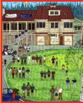
The Classic at Willow's Run