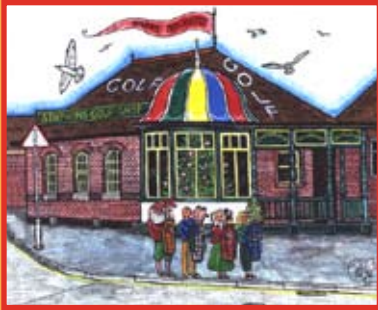
Simpson's Golf Shop

ASSORTED PACIFIC NORTHWEST & SCOTLAND SETTINGS