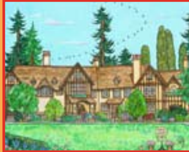
Bozarth Mansion in Bloom