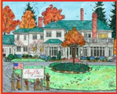
Flowerfield in the Fall (Saint George's School)