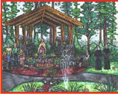
Little Grotto in the Woods