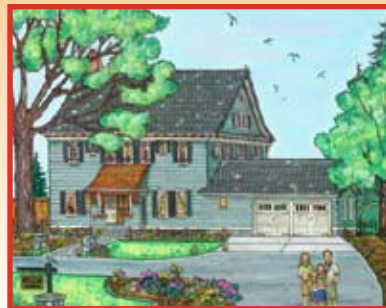
The Historic Bleeker House