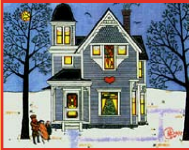
North Side Noel