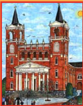
Sunday Morning at St. Al's