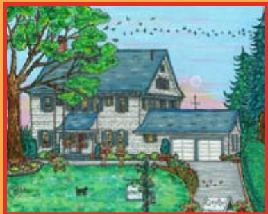
9th Avenue - Ice Skaters' Ball