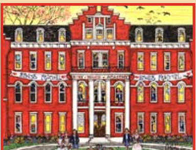
Celebrating Spring at H.N.A. (Holy Names Academy)