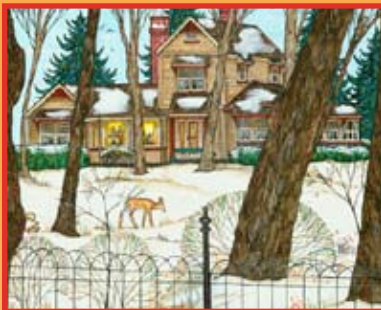
The Old Maxwell-Pettet Place