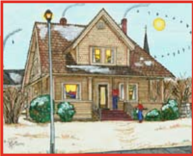
Autumn at the Alumni House (Bing Crosby Home)