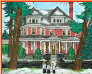
Winter at Bishop White Seminary