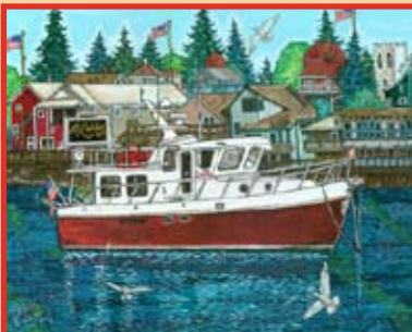
Cruising La Connor in Justatug