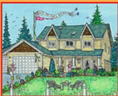
Heidi's Happy House/Ray's Roost