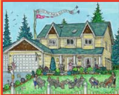
Making Merry in Monroe