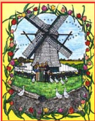
Touring the Tulip Fields