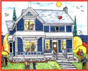
Autumn Afternoon at Anacortes

THE PICTURESQUE COMMUNITIES OF ANACORTES, BOTHELL, EDMONDS, EVERETT, LA CONNER, LAKE ROESIGNER, LAKE STEVENS, MONROE AND MOUNT VERNON