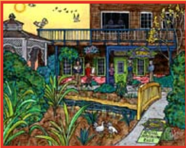
Autumn at the Artistree Gallery