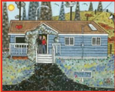
Star Creek Ranch