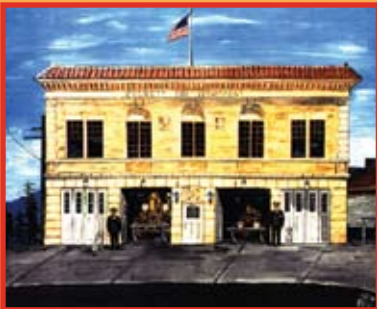
E.F.D. Old Station #2