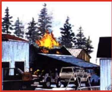
Fire at the Arlington Shed

ARLINGTON & EVERETT IN WASHINGTON, UNIONVILLE IN PENNSYLVANIA AND HOLIDAY FIRE STATION ARTWORK