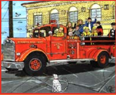
Riding in the Salty Seas Days Parade

ARLINGTON & EVERETT IN WASHINGTON, UNIONVILLE IN PENNSYLVANIA AND HOLIDAY FIRE STATION ARTWORK