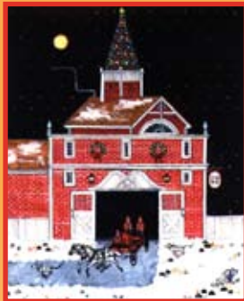
Hose #2 at Christmastime