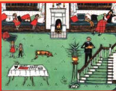
Turkey with All the Trimmings