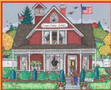
Crimson Castle School