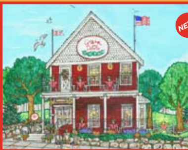
Cozy Cabbage Patch