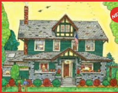
The Handsome Hansen House