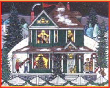
The Happy Holiday House (Harmon House)