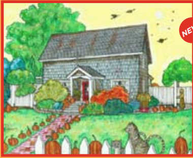
Pussycats & Pumpkins (Jordan House)

WESTERN WASHINGTON'S PICTURESQUE COMMUNITY OF REMARKABLE HISTORIC HOMES, BED & BREAKFASTS, GIFT SHOPS AND ANTIQUE EMPORIUMS