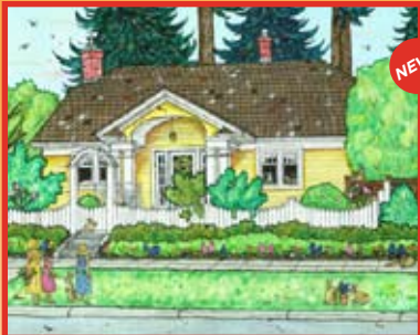
Hippy Hoppin' at the Hill House