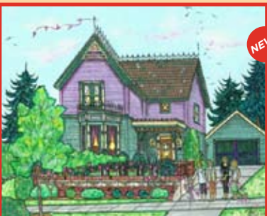
Pretty Purple Palace (Allen House)