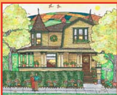
Sunflowers in Snohomish (Blackman House)