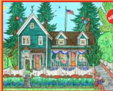
Stars & Stripes in Snohomish