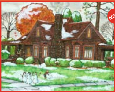
Making Snowmen at the Marks House