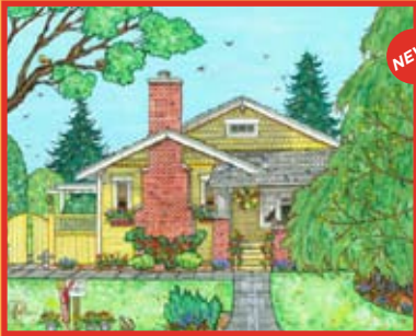
Brick Bungalow Beauty