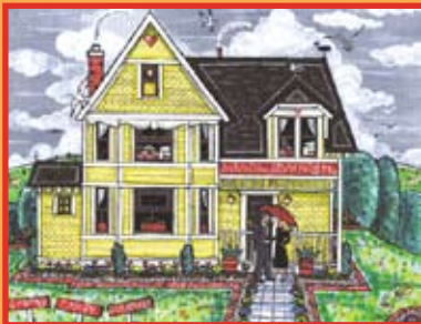
Snohomish Silver Lining Inn (Old Methodist Parsonage)