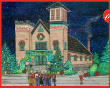
Merrymaking at Saint Michael's