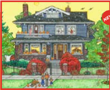
Fine Fall Foursquare (Iverson House)

WESTERN WASHINGTON'S PICTURESQUE COMMUNITY OF REMARKABLE HISTORIC HOMES, BED & BREAKFASTS, GIFT SHOPS AND ANTIQUE EMPORIUMS