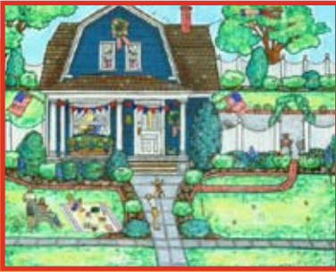
Independence Inn (Matt Albert House)

WESTERN WASHINGTON'S PICTURESQUE COMMUNITY OF REMARKABLE HISTORIC HOMES, BED & BREAKFASTS, GIFT SHOPS AND ANTIQUE EMPORIUMS