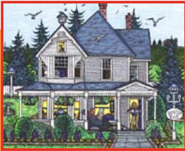
Blue Birdhouse B&B

WESTERN WASHINGTON'S PICTURESQUE COMMUNITY OF REMARKABLE HISTORIC HOMES, BED & BREAKFASTS, GIFT SHOPS AND ANTIQUE EMPORIUMS