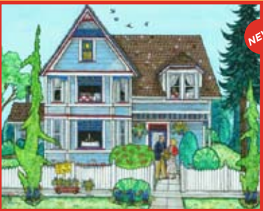
Pretty Parsonage in May