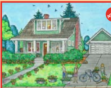
Fresh Flowers at the Wershing House