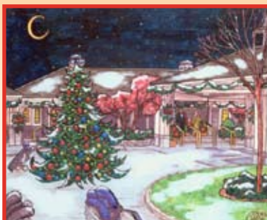
Celebrating at Overlake Golf & Country Club