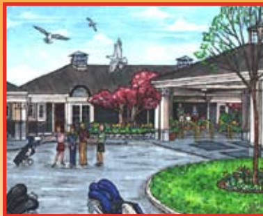
Overlake Golf & Country Club