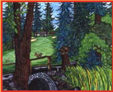
Aviary on Eight - R.O.C.C.