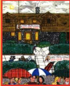
Rain or Shine at "The Canyon"