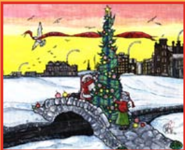
Decorating the Bridge on 18 - St. Andrews