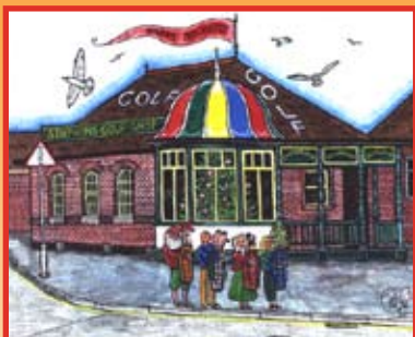
Simpson's Golf Shop