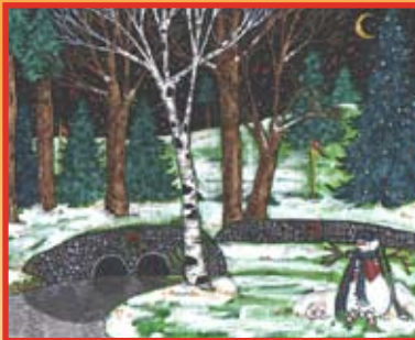
The Snowy Sentinel at R.O.C.C.