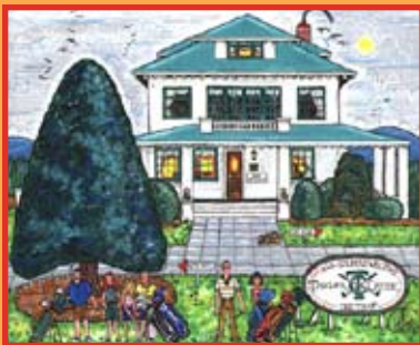
The Lady at Taylor Creek