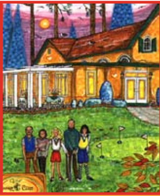
August at Inglewood

ASSORTED PACIFIC NORTHWEST & SCOTLAND SETTINGS