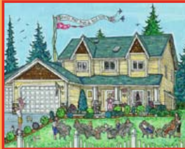
Making Merry in Monroe