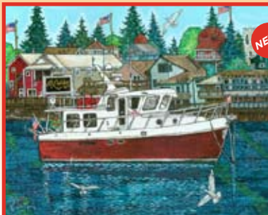
Cruising La Connor in Justatug