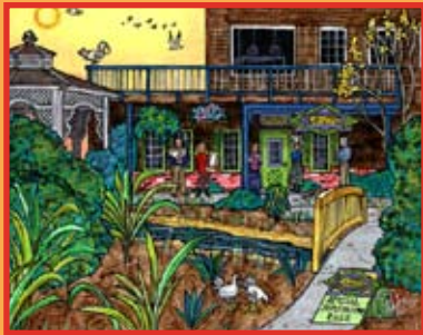
Autumn at the Artistree Gallery