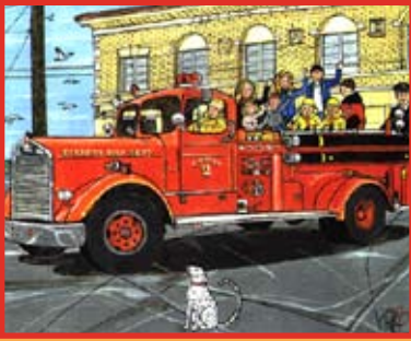
Riding in the Salty Seas Days Parade

ARLINGTON & EVERETT IN WASHINGTON, UNIONVILLE IN PENNSYLVANIA AND HOLIDAY FIRE STATION ARTWORK