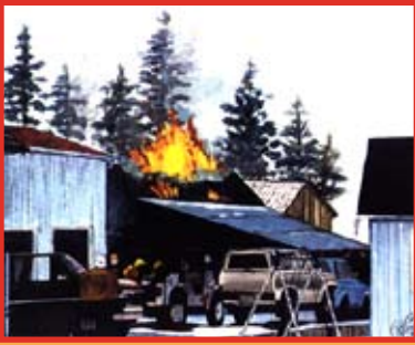
Fire at the Arlington Shed

ARLINGTON & EVERETT IN WASHINGTON, UNIONVILLE IN PENNSYLVANIA AND HOLIDAY FIRE STATION ARTWORK