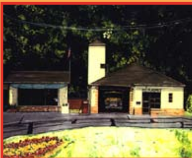
E.F.D. Old Station #4