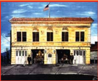
E.F.D. Old Station #2