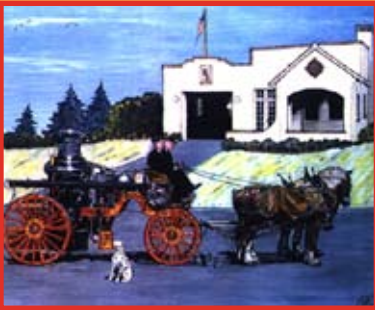
E.F.D. Old Station #1