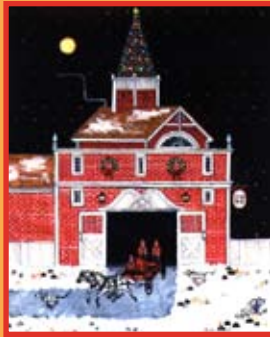
Hose #2 at Christmastime