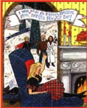
Heartfelt Holiday Wishes