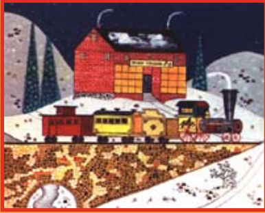
Christmas at Post Office #14

CHRISTMAS -THEMED PAINTINGS (EXCLUDING NEIGHBORHOOD & SANTA/SNOWMAN GOLF ARTWORK)